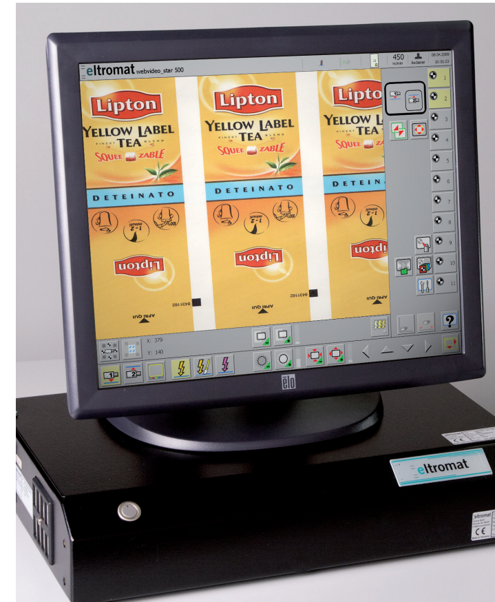
User interface with live image